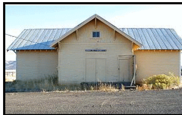
Originally, the Church of Christ building in Pleasant Valley. It is now a Grange Building.